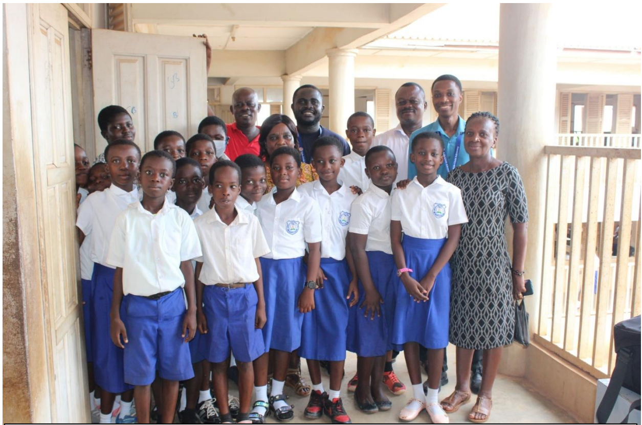
School Awareness Campaign Team with Students and Teachers of Kwadaso S.D.A School

The theme for the 2023 International Day for Street Children was “Safety for All Street-connected Children”. Safe-Child Advocacy dedicated two (2) months (March and April) towards implementing activities to mark the International Day for Street Children. These activities included a school awareness campaign, a street awareness campaign, a workshop for street-connected children, a webinar conference, media engagement/advocacy, and a workshop for Child Protection Committees (CPC’s) in three selected communities in the Northern Region of Ghana.