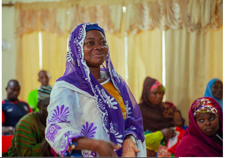
Participants from the various communities sharing their views at the workshop.