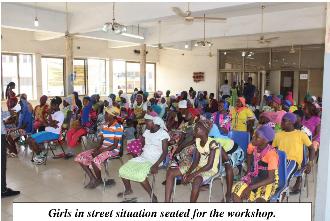
Girls in street situation seated for the workshop.

Also, 200 children in street situations received hygiene packs. This was SCA's way of helping them access their right to health. Each hygiene pack contained a pack of sanitary pad, soap, toothpaste, and toothbrush.