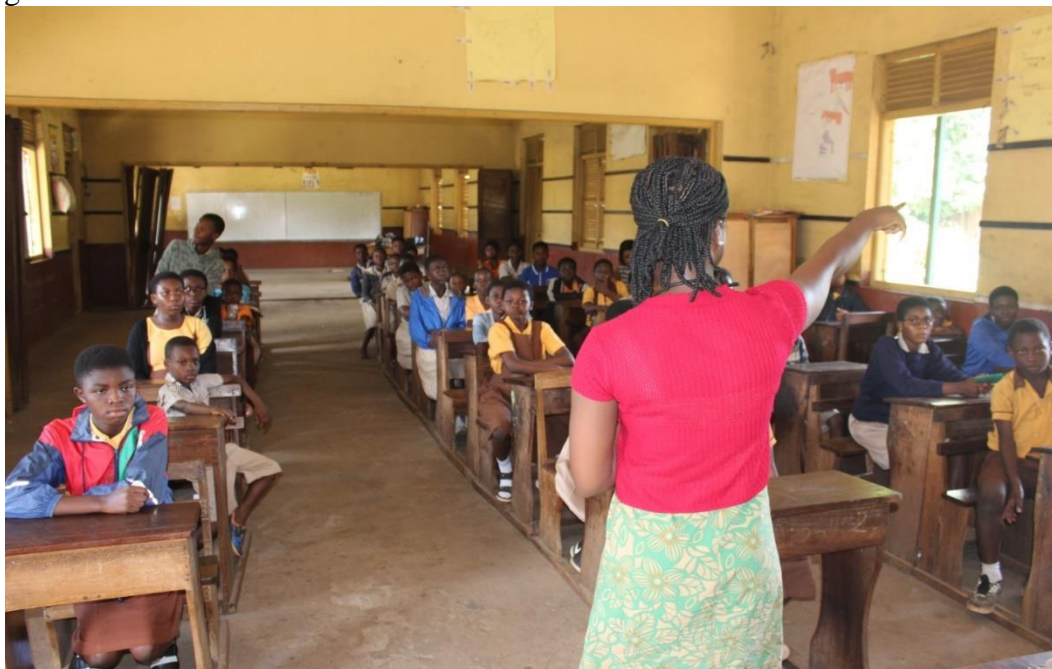
Campaign Team Member Educating Students of Yaa Achiaa M/A J.H.S on their Rights

The education provided during the campaign was highly beneficial and as a result, the authorities of these schools expressed interest in inviting the Awareness Campaign Team for more education on child rights and child protection on a regular basis. This is a positive indication that the message is spreading and more people are becoming aware of the importance of promoting child rights and protecting children.