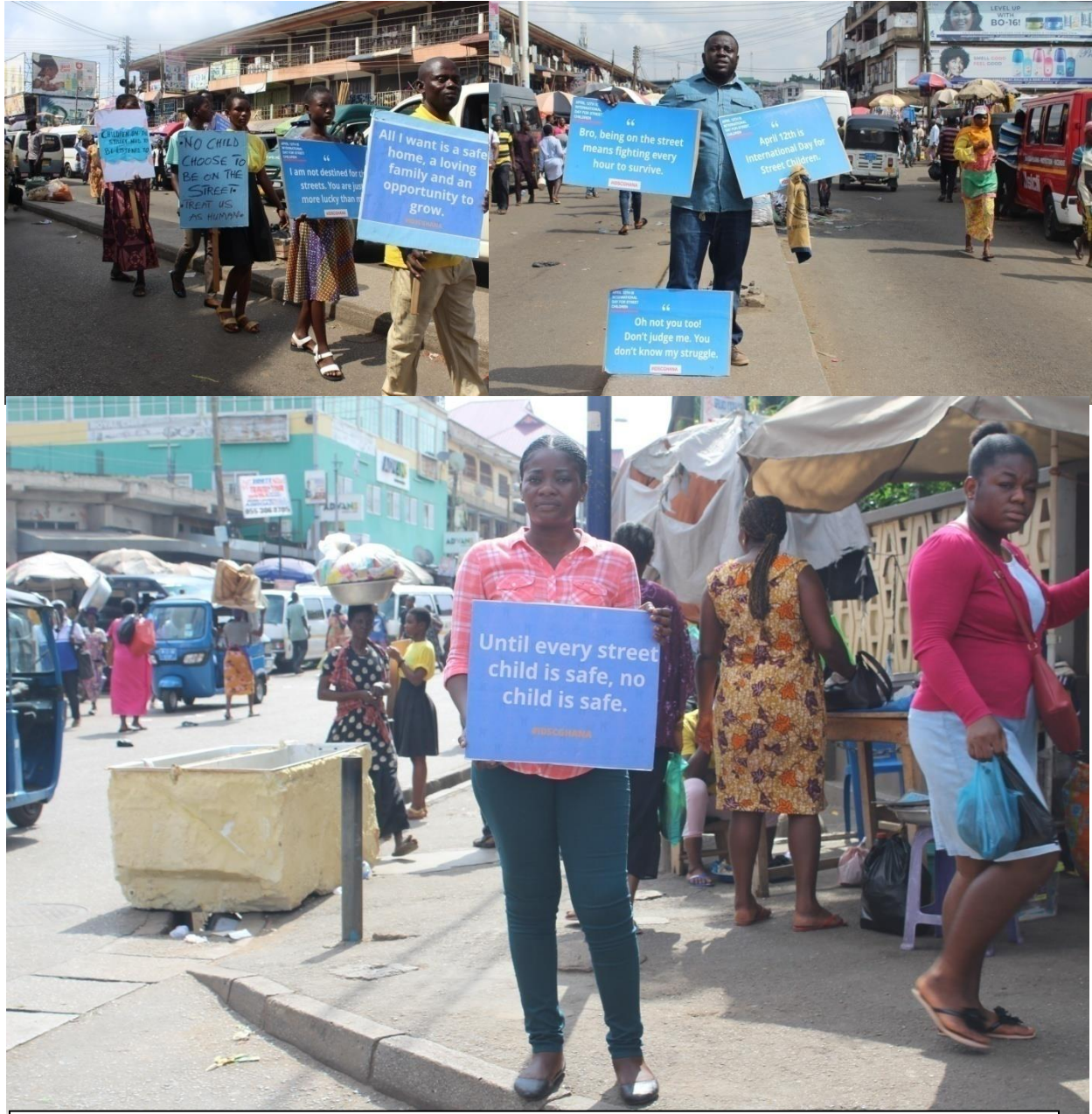
Pedestrians, Vendors, Drivers, and the General Public were sensitized on their responsibility in Keeping Street Connected Children Safe