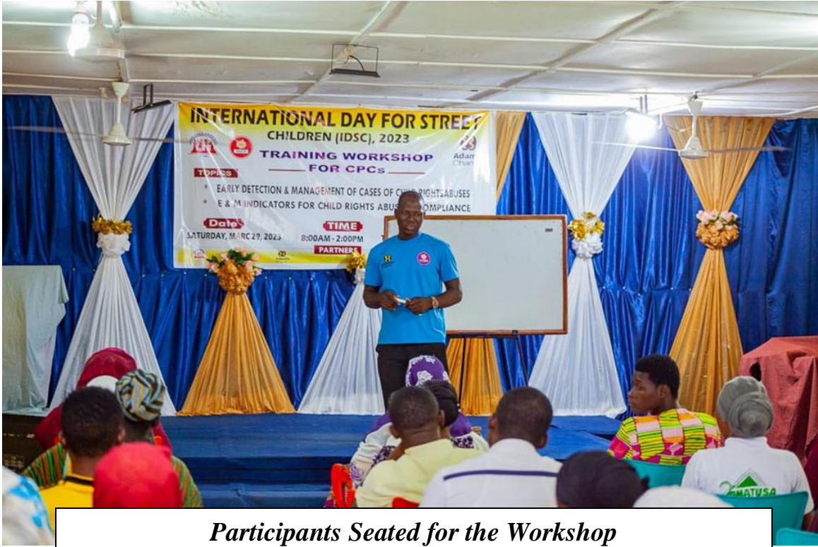
Participants Seated for the Workshop