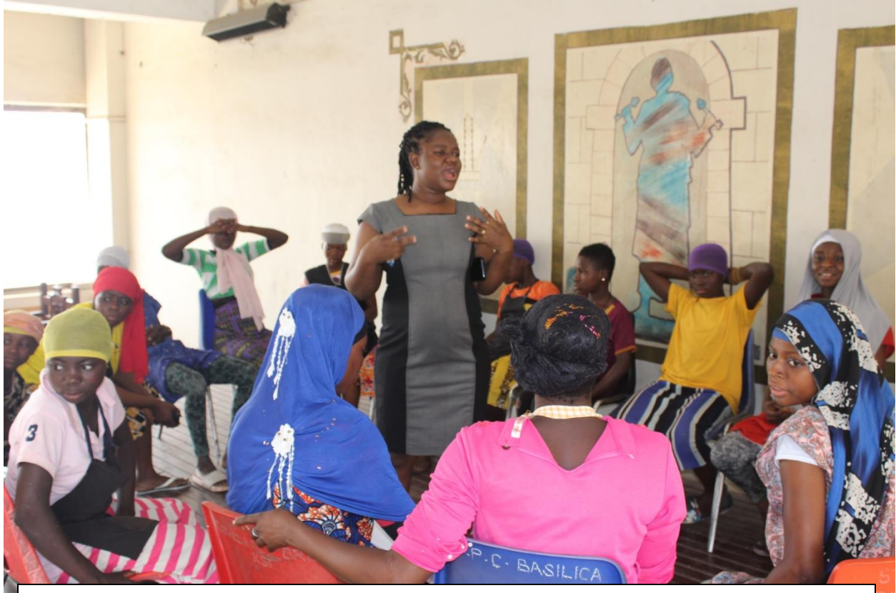
Focus Group Discussion with Street Connected Children in Kumasi