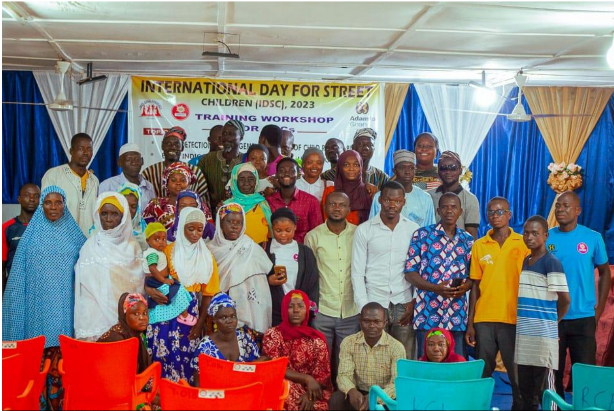
Group Picture of Partner Organization's Staff and Child Protection Committees