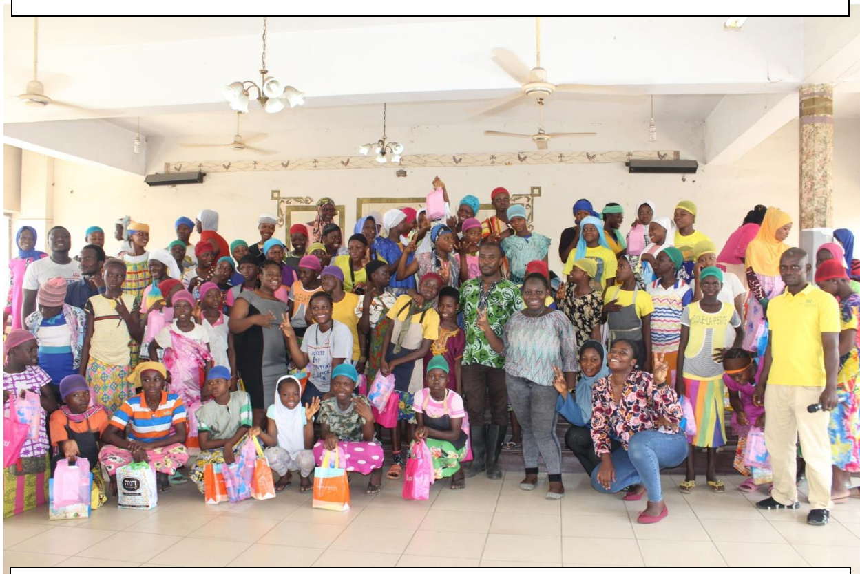
Workshop participants with staff of SCA and some partner organizations