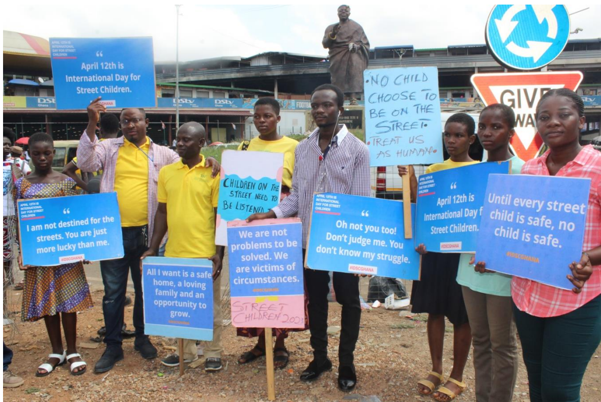
Display of Placards on the Principal Streets of Kumasi during the Street Awareness Campaign