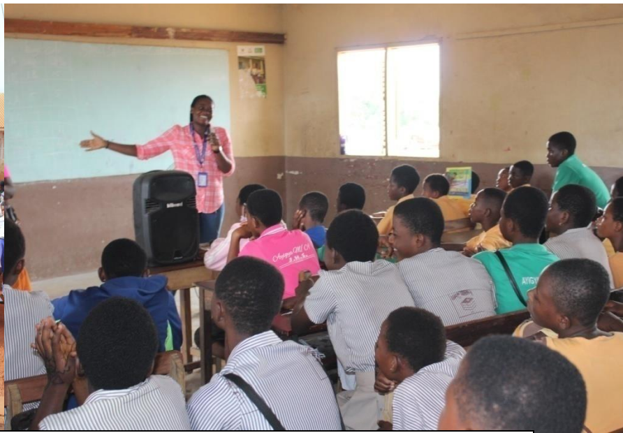
Awareness Campaign Team Sensitizing Students of selected Schools on Child Abuse, Child Rights etc.