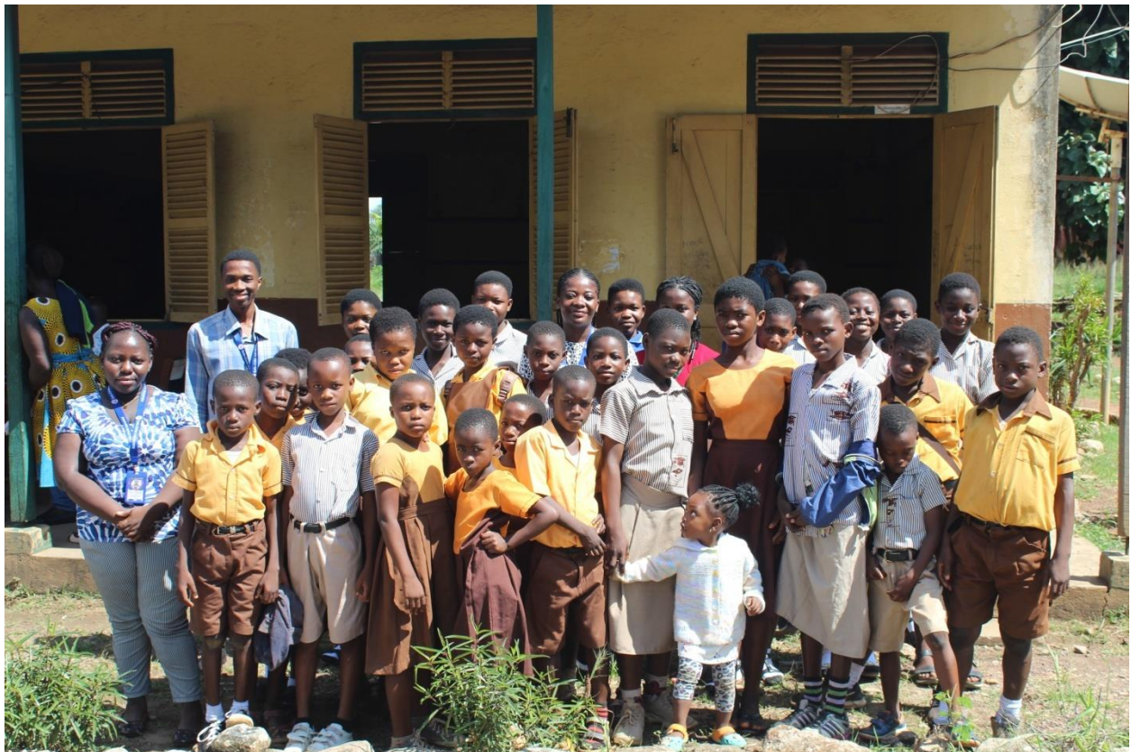
Group Picture of the Campaign Team and Students of Yaa Achiaa M/A J.H.S

The schools visited were Aburaso Methodist Junior High School, St. Louis Jubilee School, Emena M/A Junior High School, Vicande Primary and Junior High School, Kwadaso S.D.A Primary 'A' School, Kwadaso S.D.A Primary 'B' School, Yaa Achiaa Girls M/A Junior High School, and Ayigya M/A Junior High School.