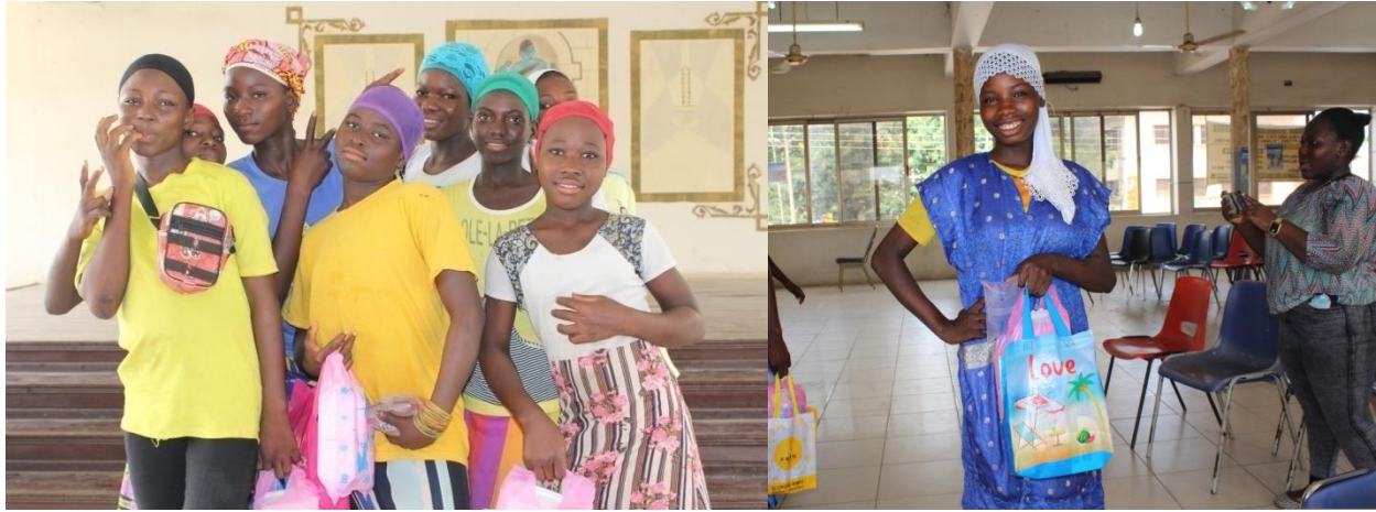
Excited participants with their food and hygiene Packs after the workshop