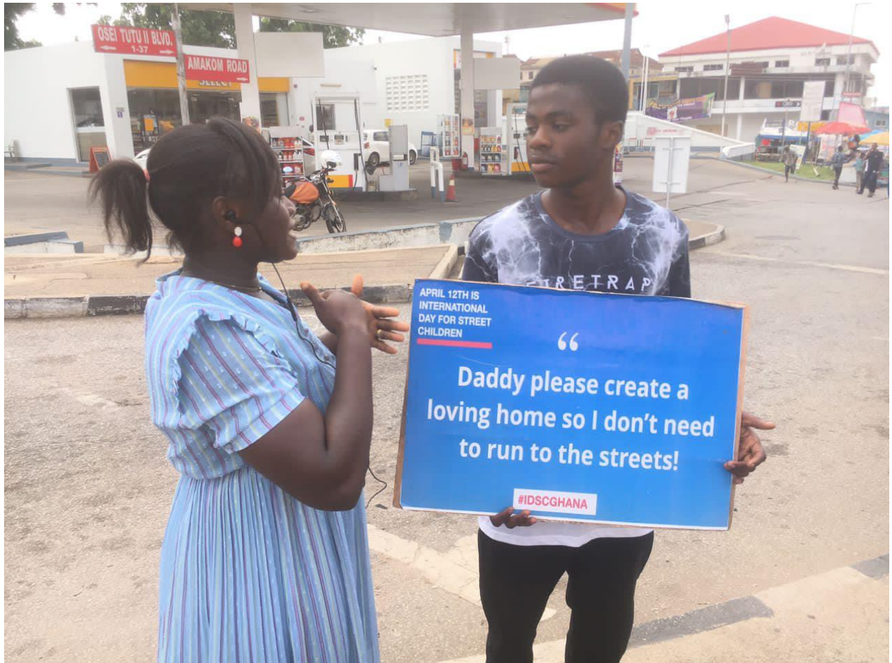
Display of Placards on the Principal Streets of Kumasi during the Street Awareness Campaign

Safe-Child Advocacy, in collaboration with other organizations working with street-connected children, embarked on a street awareness campaign on the principal streets of Kumasi on Tuesday, the 11 th of April 2023. During this campaign, placards were displayed at vantage points on the streets by the campaign team and they interacted with and educated people on the streets on the need to keep all street-connected children safe.