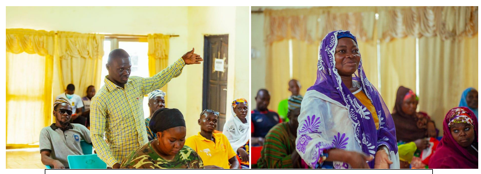
Participants from the various communities sharing their views at the workshop.