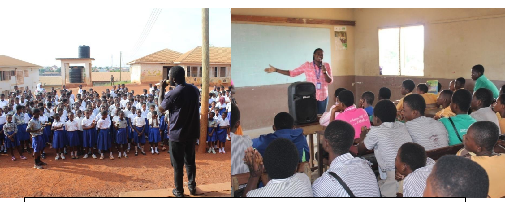
Awareness Campaign Team Sensitizing Students of selected Schools on Child Abuse, Child Rights etc.