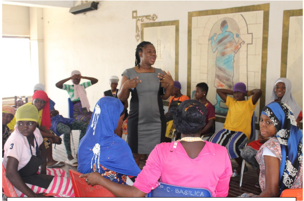
Focus Group Discussion with Street Connected Children in Kumasi