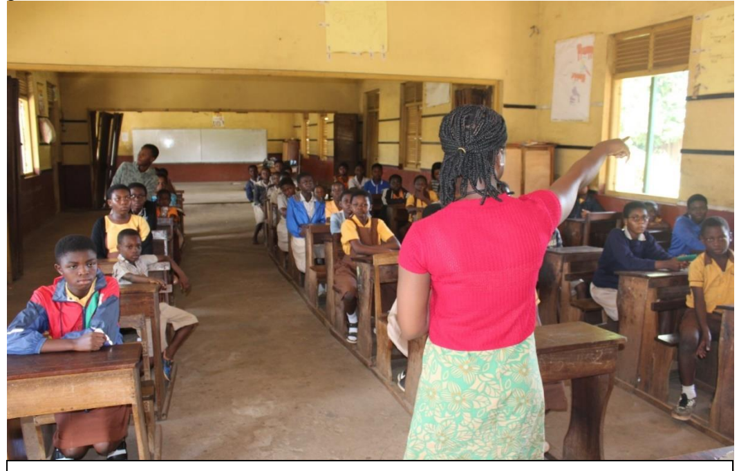
Campaign Team Member Educating Students of Yaa Achiaa M/A J.H.S on their Rights

The education provided during the campaign was highly beneficial and as a result, the authorities of these schools expressed interest in inviting the Awareness Campaign Team for more education on child rights and child protection on a regular basis. This is a positive indication that the message is spreading and more people are becoming aware of the importance of promoting child rights and protecting children.