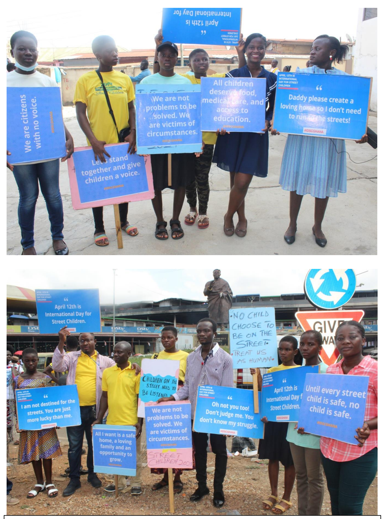
Display of Placards on the Principal Streets of Kumasi during the Street Awareness Campaign