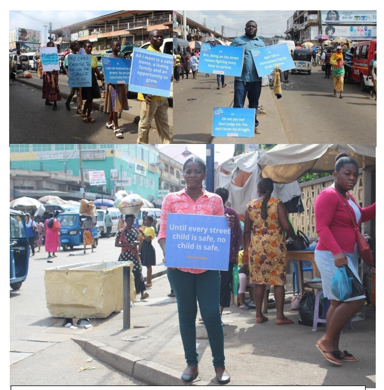
Pedestrians, Vendors, Drivers, and the General Public were sensitized on their responsibility in Keeping Street Connected Children Safe