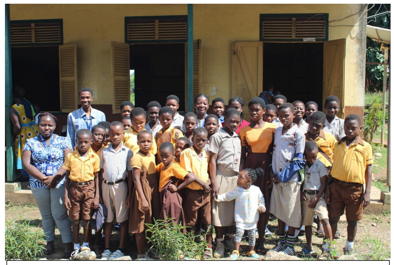
Group Picture of the Campaign Team and Students of Yaa Achiaa M/A J.H.S

The schools visited were Aburaso Methodist Junior High School, St. Louis Jubilee School, Emena M/A Junior High School, Vicande Primary and Junior High School, Kwadaso S.D.A Primary 'A' School, Kwadaso S.D.A Primary 'B' School, Yaa Achiaa Girls M/A Junior High School, and Ayigya M/A Junior High School.