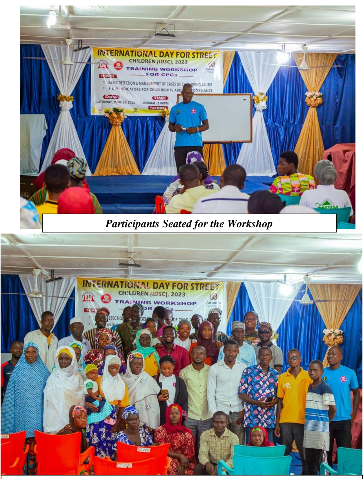
Group Picture of Partner Organization's Staff and Child Protection Committees